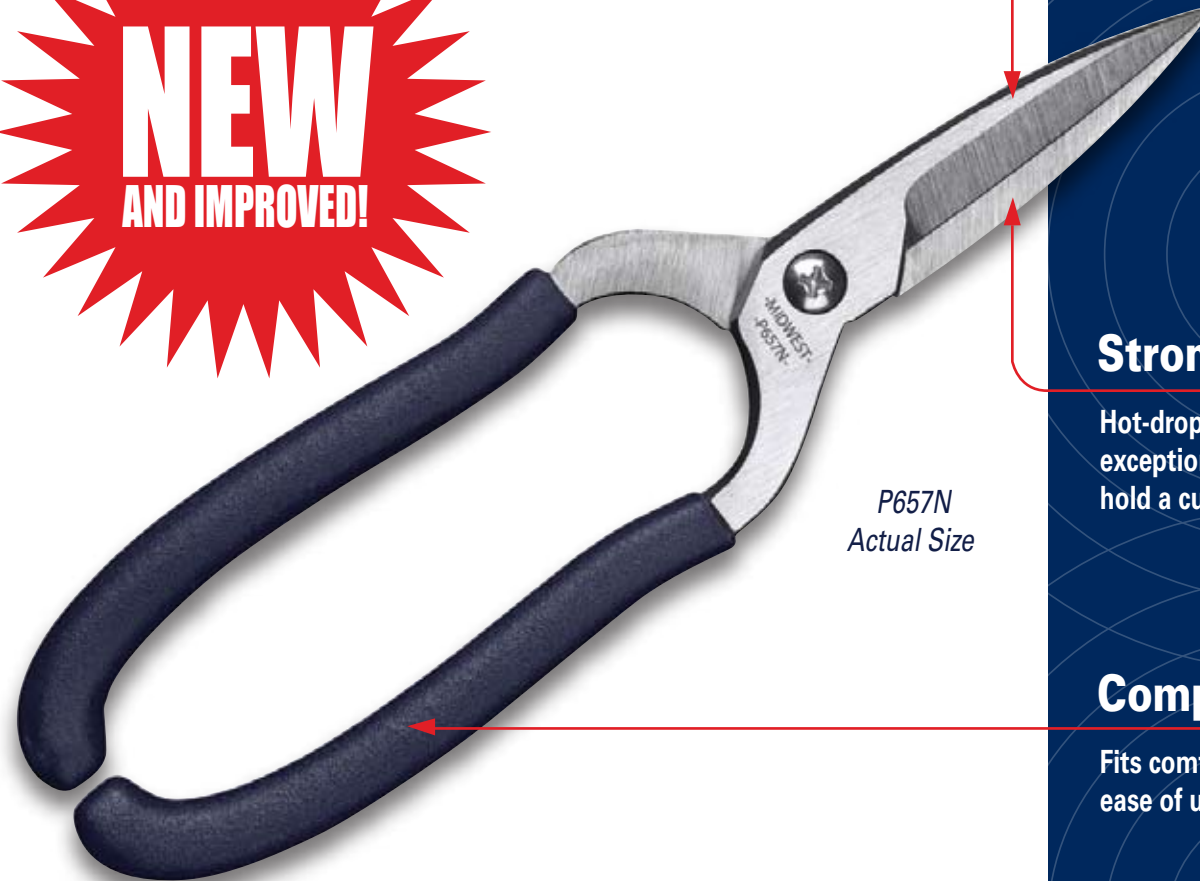
P657N Actual Size